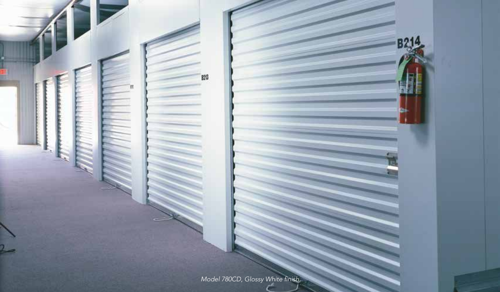
Model 780CD, Glossy White finish