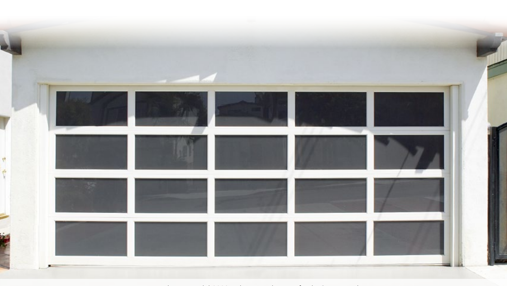
Image above: Model 9920, White powder coat finish, Gray Tint glass Cover image: Model 9920, Black finish, Satin Etched glass

The Modern Aluminum Collection doors present contemporary elegance with sleek lines while delivering maximum light infiltration into the garage space.