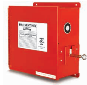
Fire Sentinel® time-delay release device