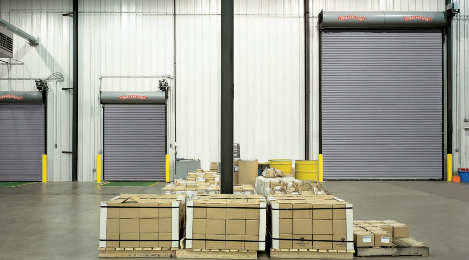
Gray finish. Installation and service: Overhead Door Company of Huntsville