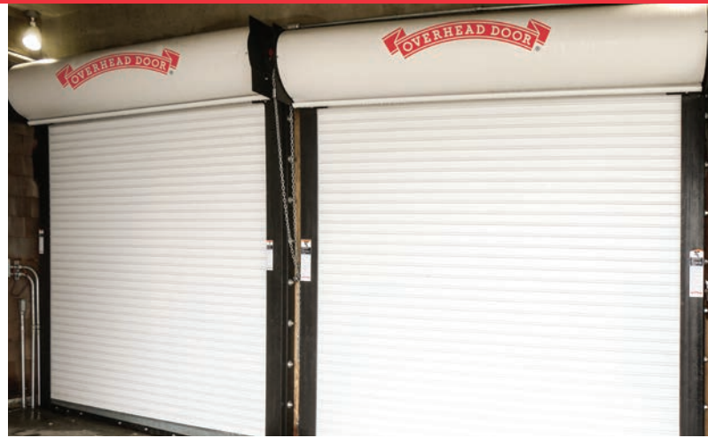
White finish. Installation and service: Overhead Door Company of Concord™

When overall performance and thermal efficiency are as essential in a rolling service door as are versatile good looks, the Stormtite™ 625 meets specification and exceeds all expectations. This heavy-duty door features insulated slats in a variety of materials – galvanized steel, stainless steel or aluminum – and offers optional wind load protection up to 170 psf. Designed to fit openings up to 30'4" wide and 28'4" high (9246 mm x 8636 mm) and offered with a broad range of product options, the versatility and functionality of the Stormtite™ 625 ensures that your design requirements will be met with ease, functionality and style.