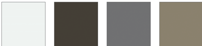
White Industrial Brown Gray Tan

Optional: Trinar White, Trinar Beige and Trinar Brown.