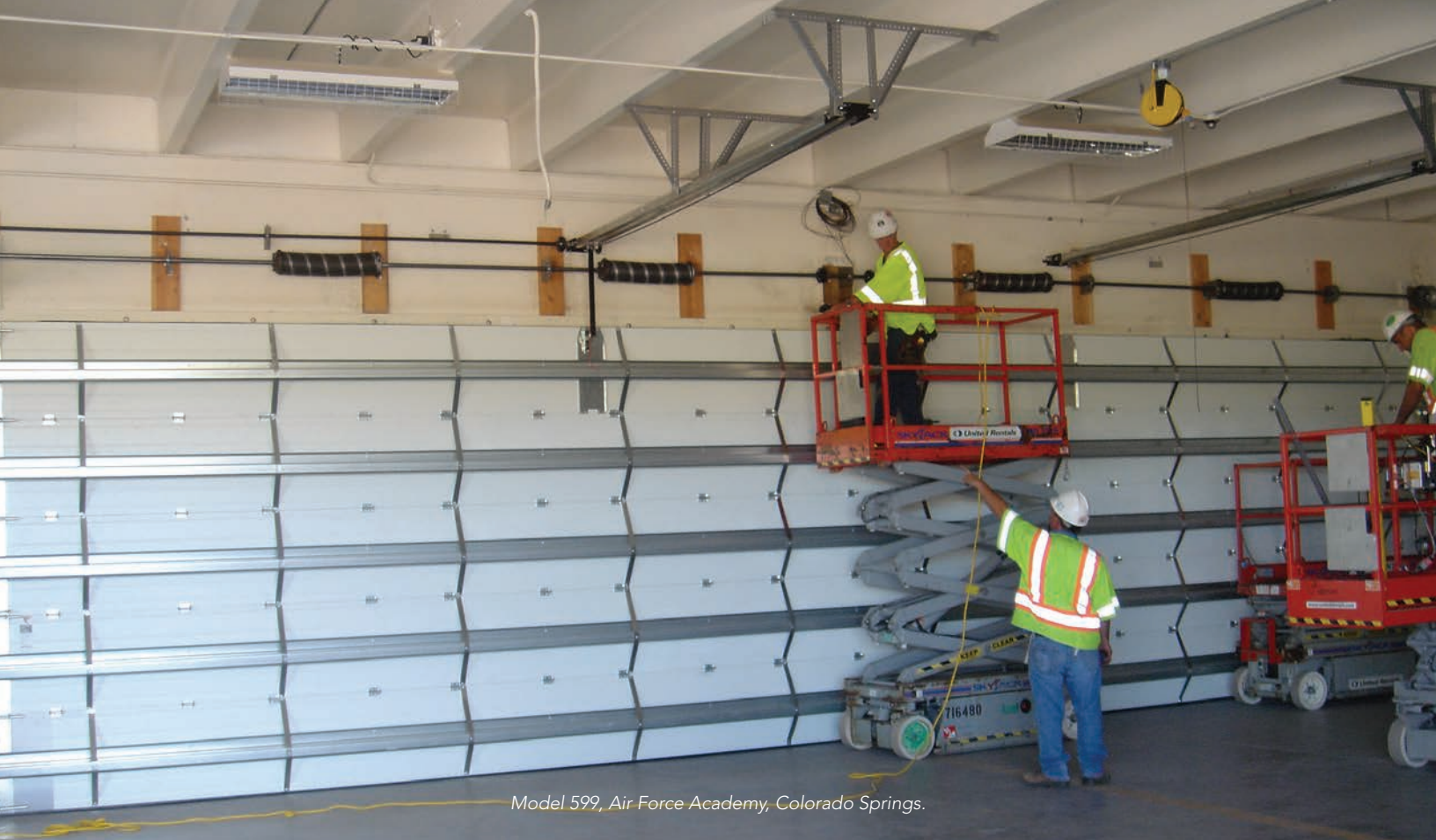
Model 599, Air Force Academy, Colorado Springs.