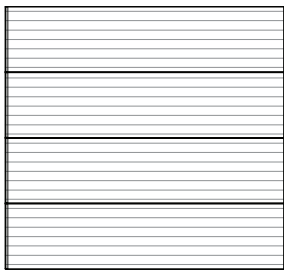
Model 592 Ribbed, textured panel