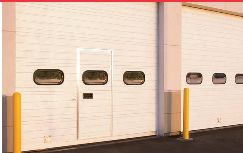
Model 592, Double Thermal Acrylic windows, White paint finish, pass door

With a 17.50 R-value (3.09 W/Msq) and .057 U-value (.324 Msq/W), the Thermacore® Models 592/599 are the energy-efficient door of choice for commercial use. The 592/599 also incorporate a thermal break and joint seal to prevent thermal transfer between exterior and interior door panel skins. The door is designed for the most demanding situations, including high-cycle, wind load and thermal applications. Built with the best technology in the business.