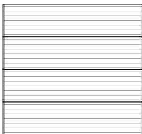
Model 592 Ribbed, textured panel