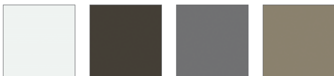
White Industrial Brown Gray Tan

Optional: Trinar White, Trinar Beige and Trinar Brown.